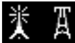
Figure 4 – Obstacle Overlay Icon (Left), Wire Overlay Icon (Right)

The Map page may be configured by the pilot to not show any obstacles or wires at any zoom scale.