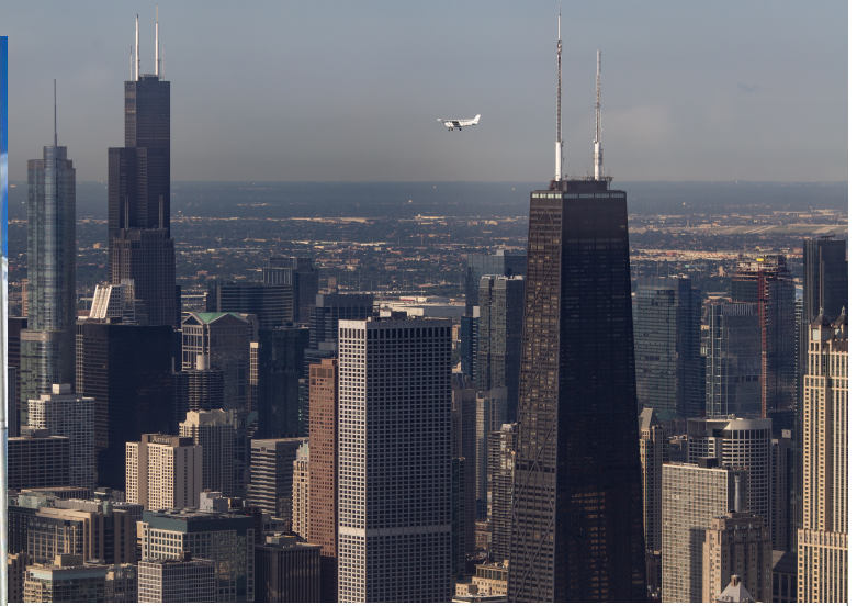
58H passing Chicago